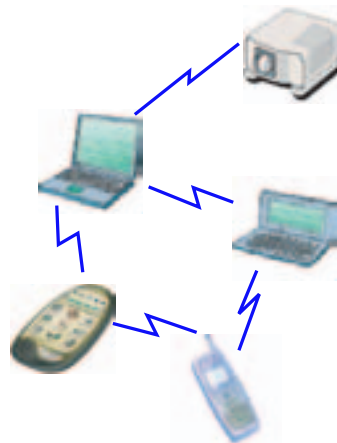
Figure 1.1: A small ad hoc network

In this context, the principle of ad hoc networking received much interest during the past five years. In an ad hoc network, mobile devices communicate with each other in a peer-to-peer fashion (see Fig. 1.1); they establish a self-organizing wireless network without the need for base stations or any other pre-existing network infrastructure. An outstanding feature of this emerging technology is wireless multihop communication : If two devices cannot establish a direct wireless link (because they are too far away from each other), devices in between act as relays to forward the data from the source to the destination. In other words, each device acts as both a mobile terminal and a node of the network. This feature is not supported in current systems for mobile communications. In this way, ad hoc networking creates a new paradigm for mobile communications, where